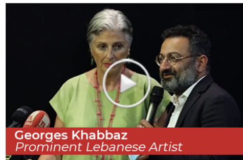
Georges Khabbaz Prominent Lebanese Artist

At the beginning, a minute of silence was observed in memory of the victims of Beirut blast, followed by a moving speech by Georges Khabbaz.